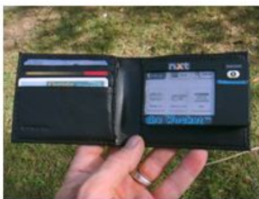
Wocket™ Prototype – Not an Actual Product

Our initial development product will be the MobileBio Wocket™ . Juniper Research estimates that worldwide mobile payment volume will grow to $240 billion in 2012, and forecasts growth to $670 billion by 2015. However, many credit card holders either do not possess a smartphone or will be reluctant to use their smartphone for mobile payments. Furthermore, physical credit card terminals requiring a card swipe will remain the most common point of sale terminal for foreseeable future. As a result, Nxt-ID is focusing its initial efforts on a product that is a separate physical secure electronic wallet that holds information from credit cards, identification cards, and virtually any other card to allow the owner of the card to configure a reprogrammable single electronic card housed in the wallet to replicate any of their cards thereby reducing the number of cards they must carry. The resultant electronic card can then be swiped just like a regular credit card. The e-wallet will be secured by a biometric identifier as well as other layers of security and will be compatible with the emerging standard for Near Field Communications (NFC) and other touchless payment methods. Our current plans call for the launch of this product during the second half of 2013. We intend to pursue partnerships with financial institutions to launch this product although we do not yet have any existing relationships with potential partners.