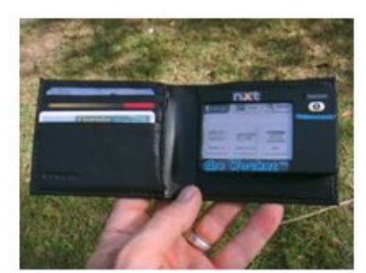
Wocket ™Prototype - Not an Actual Product

Our initial development product will be the MobileBio Wocket <sup>TM</sup>. Juniper Research estimates that worldwide mobile payment volume will grow to $240 billion in 2012, and forecasts growth to $670 billion by 2015. However, many credit card holders either do not possess a smartphone or will be reluctant to use their smartphone for mobile payments. Furthermore, physical credit card terminals requiring a card swipe will remain the most common point of sale terminal for foreseeable future. As a result, Nxt-ID is focusing its initial efforts on a product that is a separate physical secure electronic wallet that holds information from credit cards, identification cards, and virtually any other card to allow the owner of the card to configure a reprogrammable single electronic card housed in the wallet to replicate any of their cards thereby reducing the number of cards they must carry. The resultant electronic card can then be swiped just like a regular credit card. The e-wallet will be secured by a biometric identifier as well as other layers of security and will be compatible with the emerging standard for Near Field Communications (NFC) and other touchless payment methods. Our current plans call for the launch of this product during the second half of 2013. We intend to pursue partnerships with financial institutions to launch this product although we do not yet have any existing relationships with potential partners.