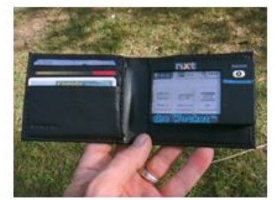
Wocket™ prototype Not an Actual Product

We believe that many credit card holders either do not possess a smartphone or will be reluctant to use their smartphone for mobile payments. Nxt-ID is in the process of developing a separate physical electronic wallet that is intended to hold information from credit cards, identification cards, and virtually any card to allow a specific owner of the card to configure a single electronic card to replicate any of the copied cards and thereby reduce the number of cards a user must carry. As designed, users will simply scan in each card and take its picture, front and back, slide through each of the scanned "soft-cards" via a display and select the card that the user wishes to program the mCard (multi-Card). The resultant electronic card can then be swiped just like a regular credit, debit, or virtually any other card. The system consists of 2 devices: A card reader/writer "wocket" and "mCard". The e-wallet will be secured by biometric identification and will be compatible with the emerging standard for Near Field Communications (NFC). The Wocket<sup>TM</sup> has completed the design stage and prototypes are currently being fabricated.